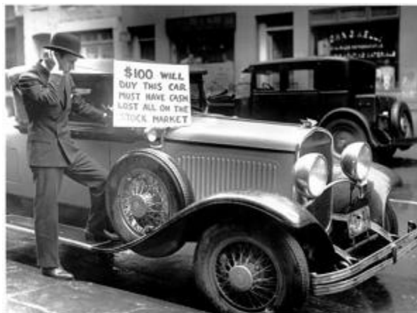
"100.00 WILL BUY THIS CAR, MUST HAVE CASH, LOST ALL ON THE STOCK MARKET"