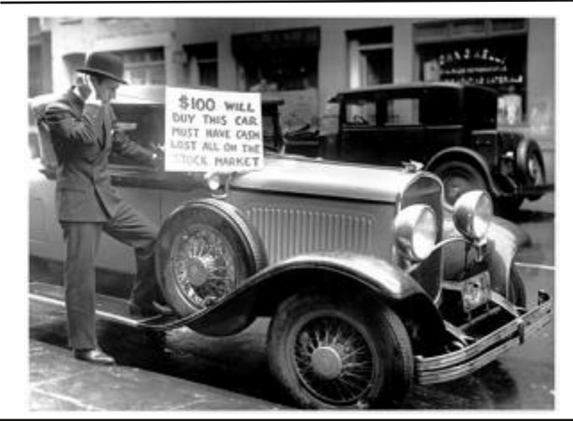
100.00 WILL BUY THIS CAR, MUST HAVE CASH, LOST ALL ON THE STOCK MARKET"

BUY, SALE, TRADE 1986 GMC for sale. 350 Corvette engine, lifts. Asking $5,500 OBO. Call Joy, 855-2917. Vehicle located at 1300 W Marine Dr., #25, Moses Lake.