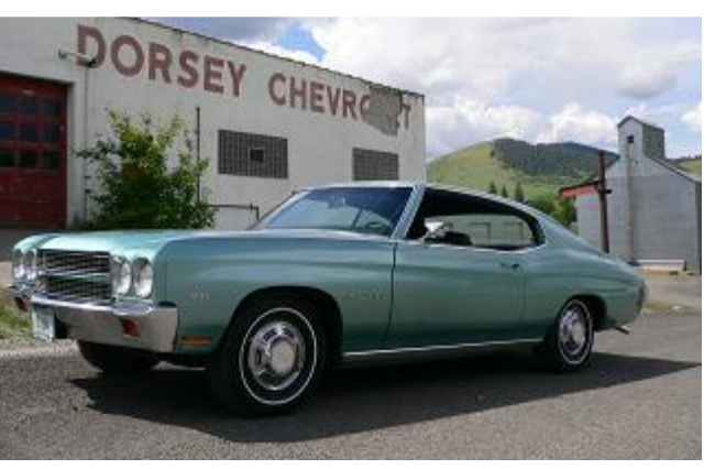
December Car of the Month